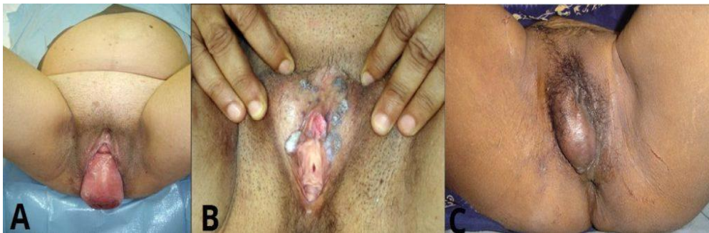
Fig 1 - Signs on external inspection during the bimanual examination. A) Uterine prolapse, b) Genital warts, c) Bartholin's cyst.