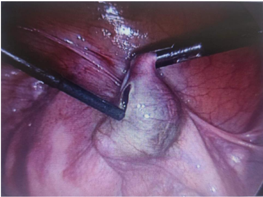
Fig. 2. Laparoscopic tubotomy, evacuation of the fertilized egg. Operation stage.