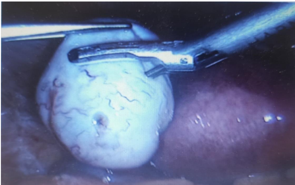
Fig. 3. Laparoscopic resection of the ovary. Operation stage.

It is carried out in case of ovarian apoplexy, polycystic ovary syndrome with the aim of creating benign ovarian formations. Excision of the ovary area is carried out with the help of a needle monopolar electrode. For subsequent hemostasis, a bipolar or argon plasma coagulator is used.